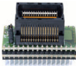
DiskOnChip Millennium TSOP-II ZIF Adapter

The DiskOnChip Millennium TSOP-II ZIF adapter interfaces directly with M-Systems GANG programmer. Up to eight Millennium adapters can be attached to the GANG for duplication. The adapters can also be used in any DiskOnChip 32-pin socket.