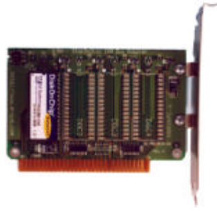
DiskOnChip DIP 2000 & Millennium